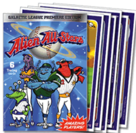
Card packs are $3.95 each, or 3 packs for $8.95.